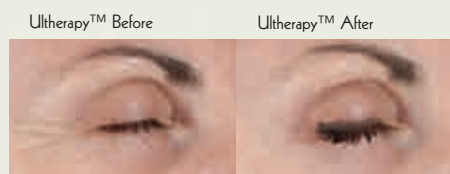
Photographs provided by Ulthera Inc. with signed photograph release from the subject. Photographs have not been edited, and are in no way laudatory nor promotional.

ASIA HEALTHPARTNERS PTE LTD 304 Orchard Road #05-06 Singapore 238863 Tel: 6235 8411 Website: www.asiahealthpartners.com /www.drvanessaphua.com